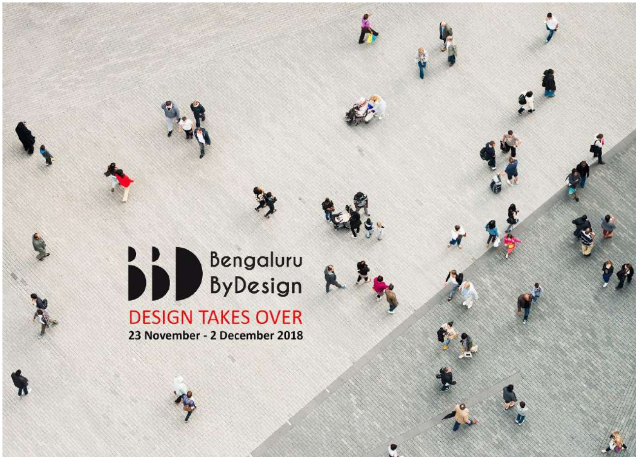
26 October 2018: The first edition of design festival <u>Bengaluru ByDesign</u> is all set to transform the city of Bengaluru from 23rd November to 2nd December 2018.

Bengaluru ByDesign aims to celebrate creativity, encourage design thinking and explore the innovations in design today. The Festival focuses on demystifying design and making it more accessible to the public through installations, exhibitions, workshops, conferences, events, screenings, pop-ups, talks and more. The 9-day design programme, 23 November - 2 December 2018, will shine the spotlight on India's design talent whilst also functioning as a platform for global creative dialogue, featuring a strong participation from design professionals from across the world.